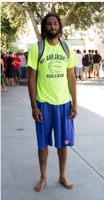
Basketball player Levon goes barefoot for the TOMS No Shoes Campaign on Aug. 23.

Together they emphasized that student athletes not only represent themselves and the team, but they also represent the school. Bad be-