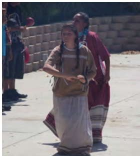
Red Tail Spirit Dancers