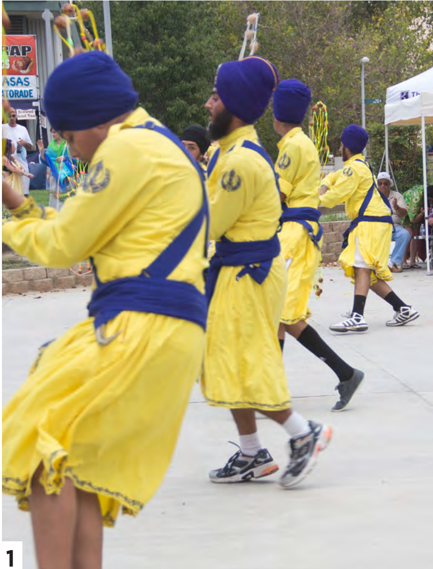
1-3: Members of the Sikh martial arts exhibition

Sept. 7, on the San Jacinto Campus