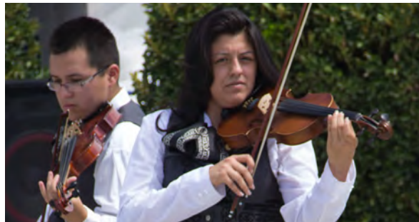
Graduates of San Jacinto High School mariachi group

The Talon is MSJC's first news publication in over a decade, brought to you by a group of talented students dedicated to informing and representing the student body. We're always looking for more writers, photographers, and graphic designers. If you'd like to join our team email us at msjctalon@gmail.com .