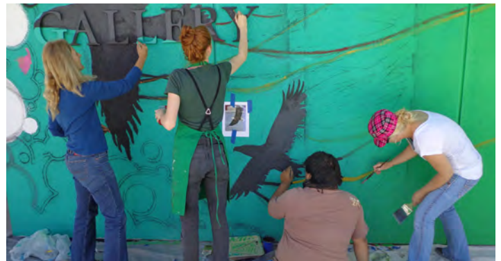
Art students paint a mural on the San Jacinto campus art gallery .