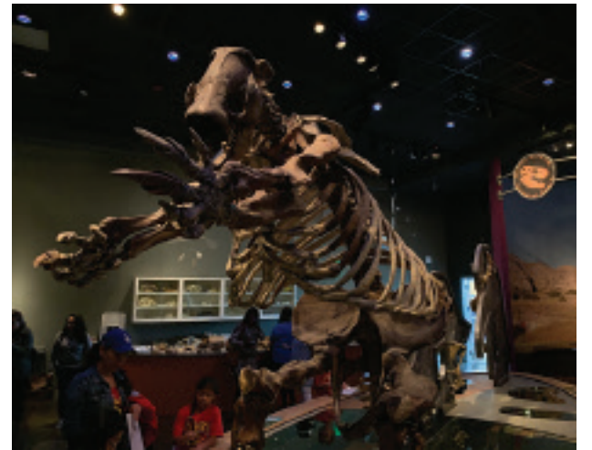
Fossil in the main hall exhibit