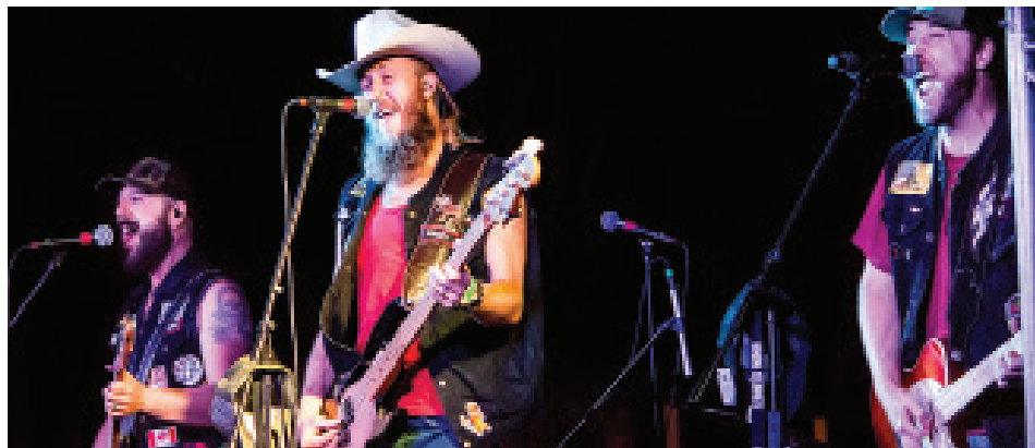
Performers singing their last hoorah