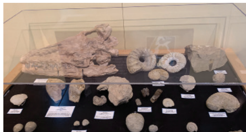
Fossils in the Life in the Ancient Seas Exhibit