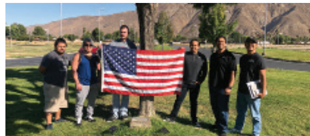
Members of Veterans services and others by the 9/11 Commemoration Plaque

Pictured here are some of the Veterans Service members who were excited about this new addition. We hope that you have the chance to stop by and offer a moment of silence for the victims of 9/11.