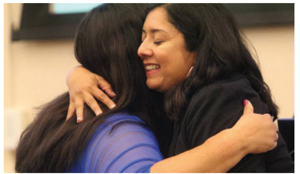
Spreading support and compassion at Dia de la Familia Provided by MSJC Marketing Staff

After Olivio's presentation, attendees had the following workshops for the first session to choose from - "Following Your Curiosity: Turning Your Passions into a Major and Career;" Immigration-Where are we? Where do we go from