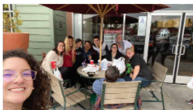
SI Leaders and staff members attending a fundraiser at Panda Express