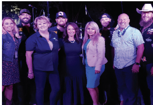
Group photo with band members and others at August Kool Nights