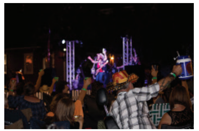
Crowd members singing along and raising their drinks at August Kool Nights