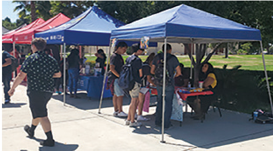
Students at Club Rush