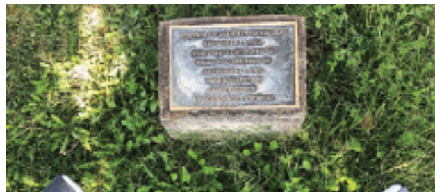
MSJC 9/11 commemoration plaque