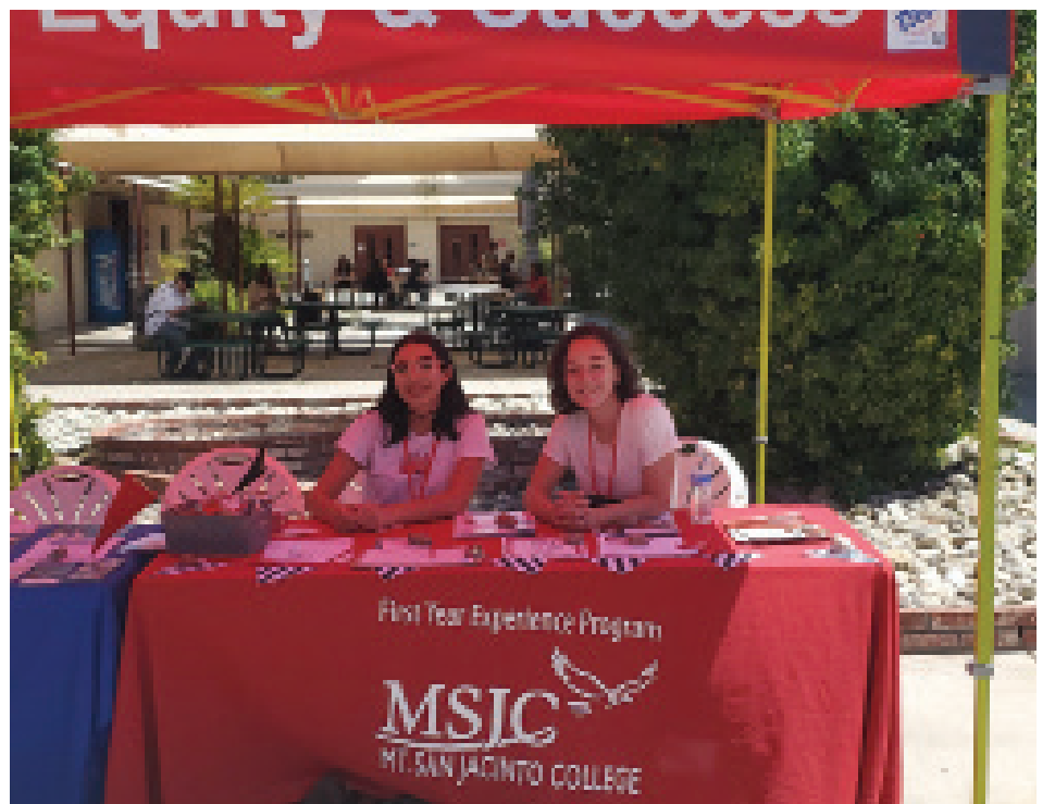
MSJC's First Year Experience booth at SJC's Club Rush