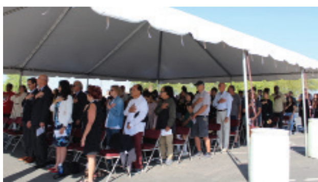
Attendees doing the pledge of Allegiance