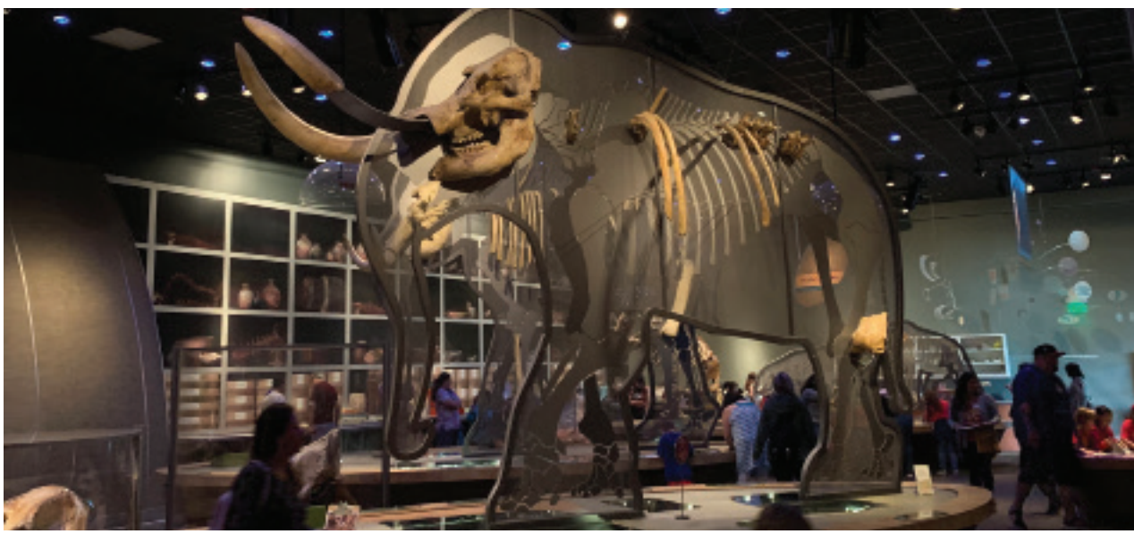
Max the Pacific Mastodon

Center prides itself on being a regional museum, meaning the exhibits on display were mostly found locally in the Inland Empire.