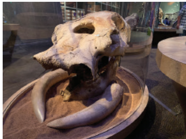
Fossil in the main hall exhibit