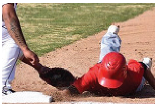
Baseball player diving into first base

"Treat their teammates in an abundance mentality... Play for the team not them-