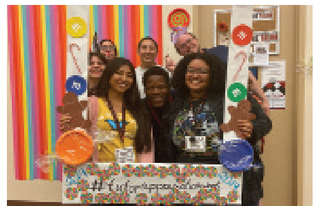
Tutors of the SJC LRC celebrating tutor appreciation week