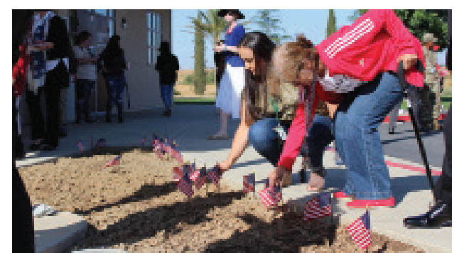
Other attendees placing their flags