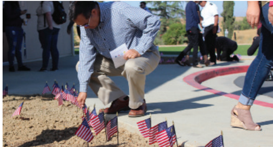
More participants placing flags to commemorate the victims of 9/11