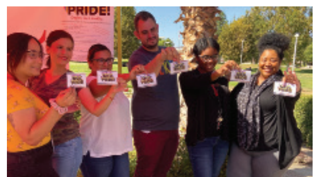
MSJC staff and students celebrating Pride Week (read more in our next issue)