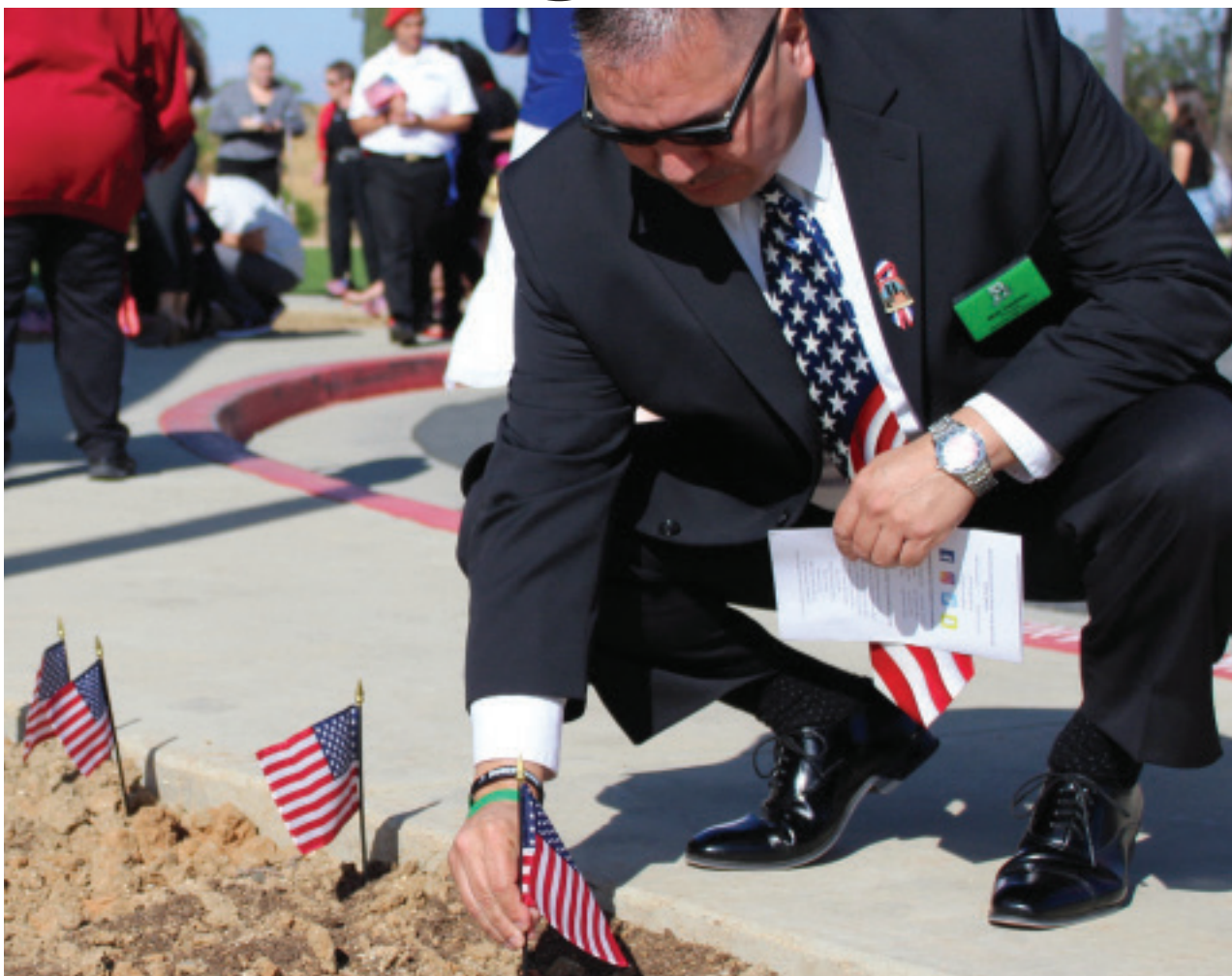
Event participant placing flag down in commemoration of the victims of 9/11