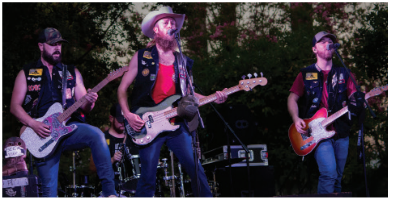
Redneck Rodeo performance at August Kool Nights

The fourth band that performed on the last week of August was the band Redneck Rodeo, who played country western music. The vendors featured were Big Daddy's BBQ, with their homemade peach cobbler, and Bamboo Ice along with