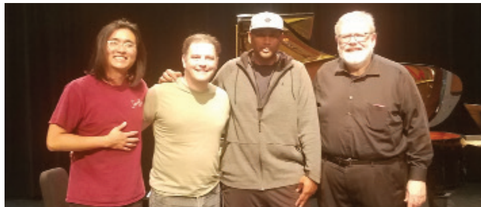
Group photo of the performers from Los Valentés