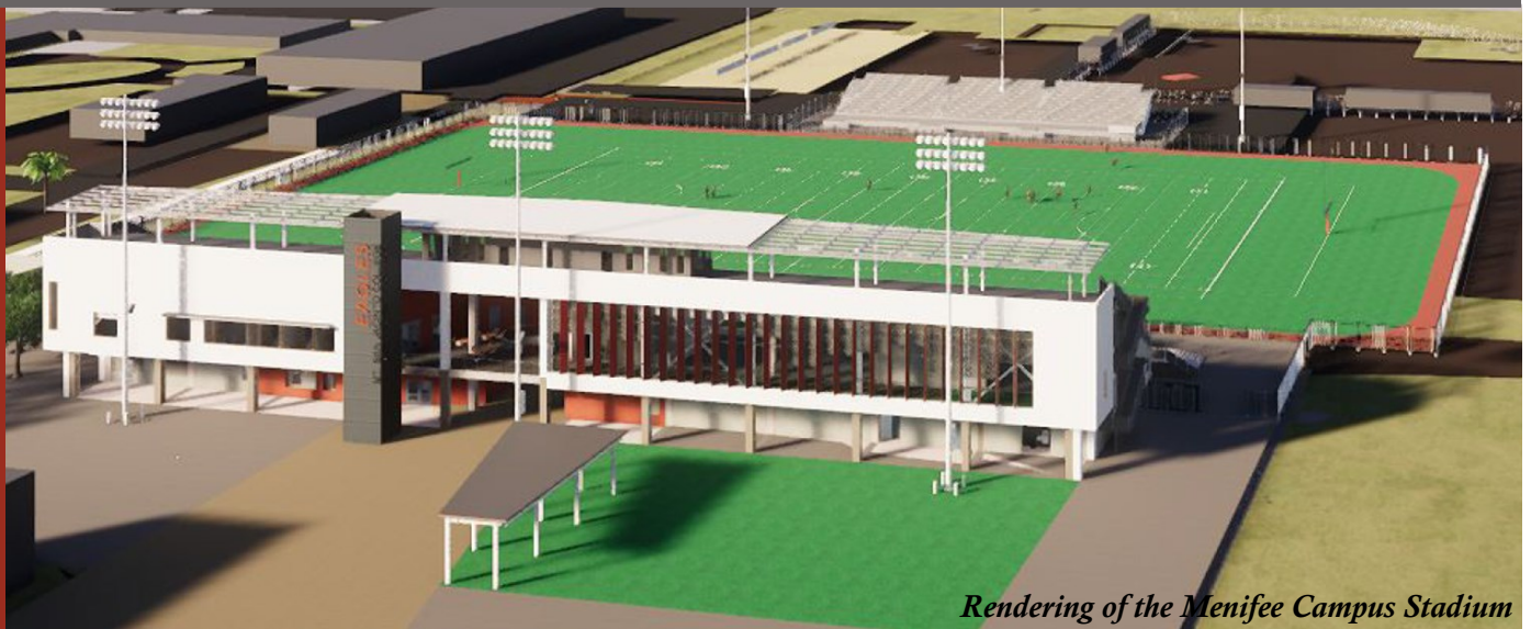
Rendering of the Menifee Campus Stadium