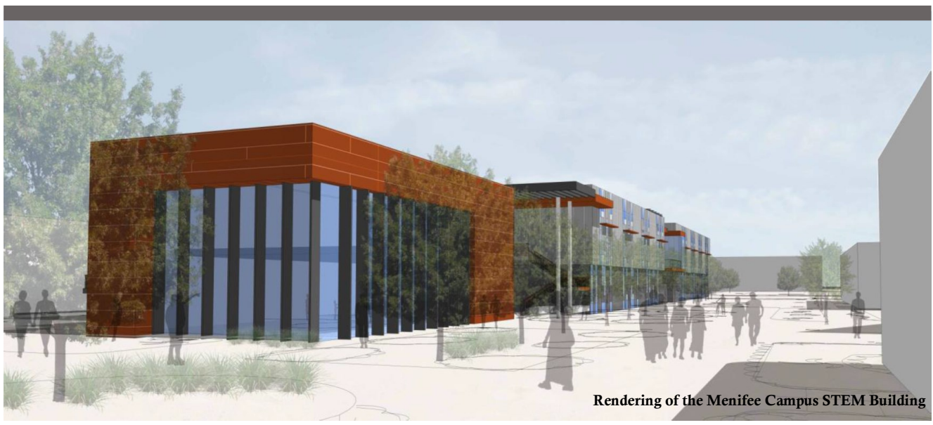
Rendering of the Menifee Campus STEM Building

Chair, Independent Citizens' Oversight Committee