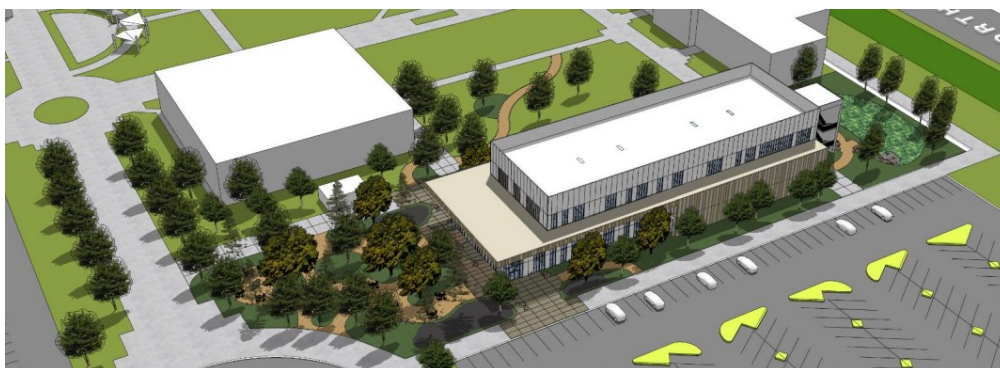
Rendering of the San Jacinto Campus STEM Building

The results of the audit indicated that, in all significant respects, Mt. San Jacinto Community College District properly accounted for the expenditures held in the Measure AA General Obligation Bond Fund and that such expenditures were made for authorized Bond projects. There were no salaries of administrators charged to the Bonds for District general administration or operations. District procedures for disbursement of funds were applied in accordance with laws and regulations, as well as policies approved by the Board of Trustees. The audit had no adverse findings and no questionable costs were noted.