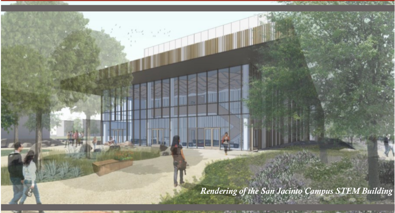
Rendering of the San Jacinto Campus STEM Building