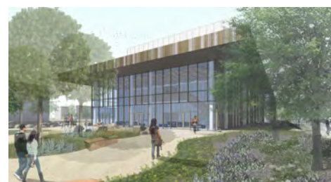
STEM Center San Jacinto Campus