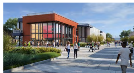
STEM Center Menifee Valley Campus