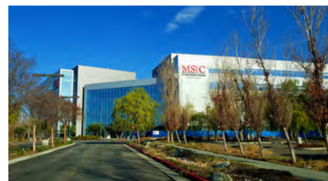
Temecula Valley Campus