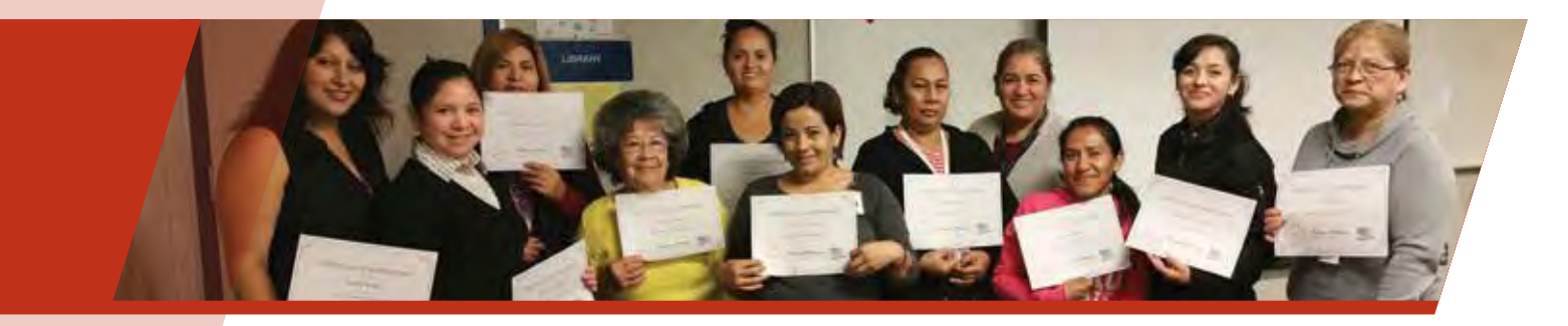
Non-Credit Adult Education classes provide adult students throughout our region access to a variety of free courses to assist them in reaching their personal, academic and professional goals. MSJC offers non-credit classes in these main areas of focus: