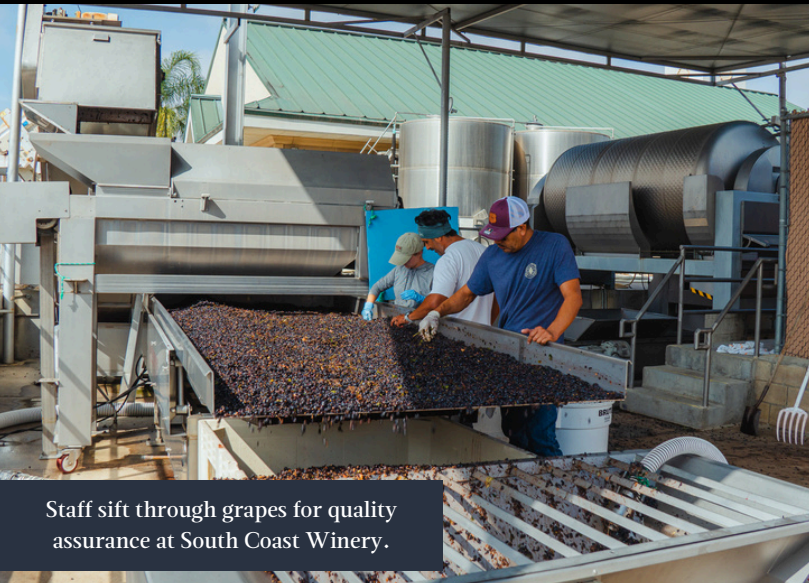
Staff sift through grapes for quality assurance at South Coast Winery.