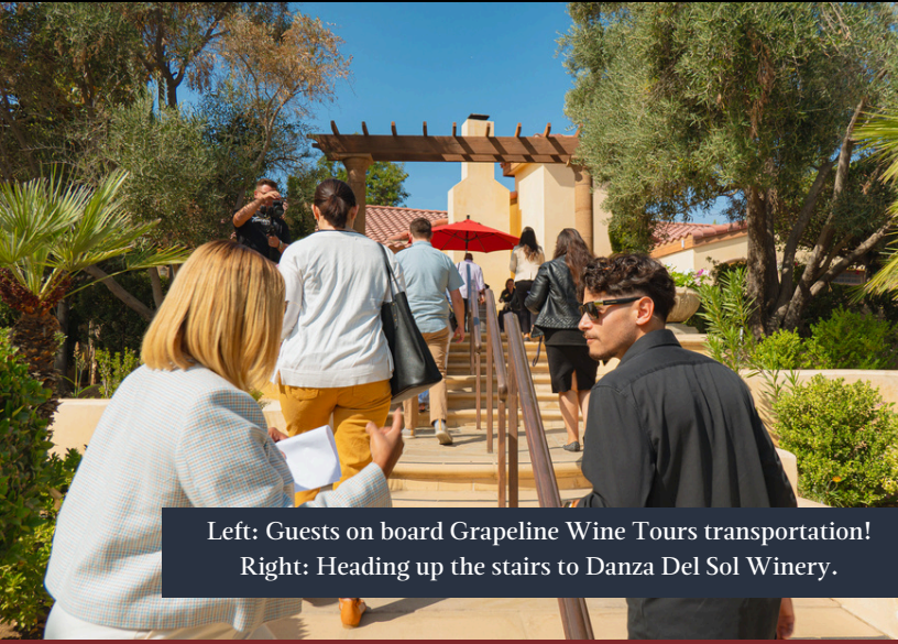
Left: Guests on board Grapeline Wine Tours transportation! Right: Heading up the stairs to Danza Del Sol Winery.

Attendees learned about the crucial role transportation plays in the wine industry's success, from tourist experiences to logistics management.