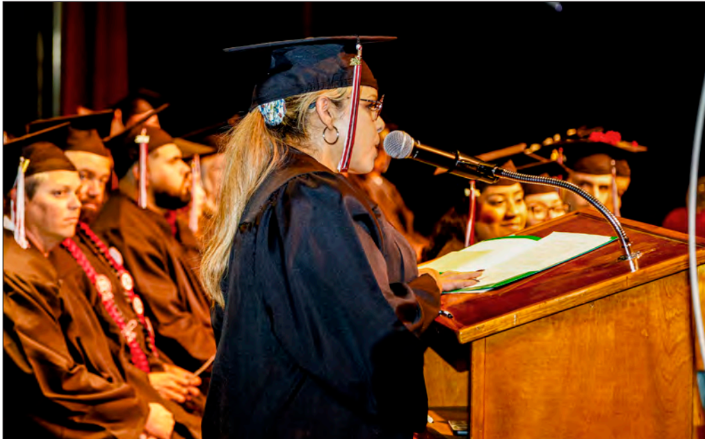
Preparing Students to Be Community Ready, College Ready, and Career Ready

If you have any questions, please email us at: AdultEducationandNon-Credit@msjc.edu