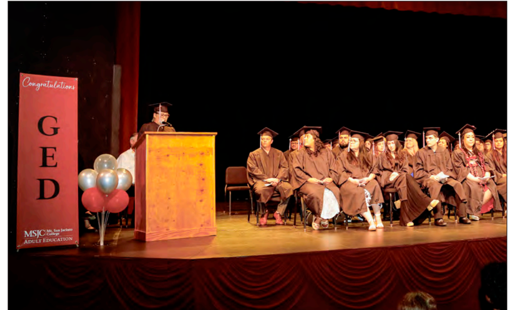
Preparing Students to Be Community Ready, College Ready, and Career Ready