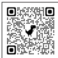
QR Code for IPark

For further assistance with purchasing parking permits, please contact us at: Phone: (951) 487-3707 Email: AdultEducationandNon-Credit@msjc.edu .